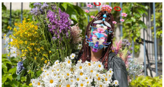
Shivay La Multiple